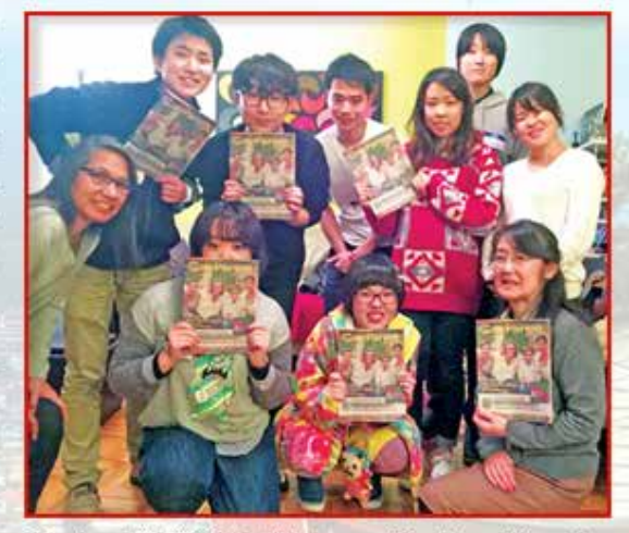
Meeting with LGBT Youth Japan and Gay Parent Magazine.

For more photos visit http://blog.gayparentmag.com